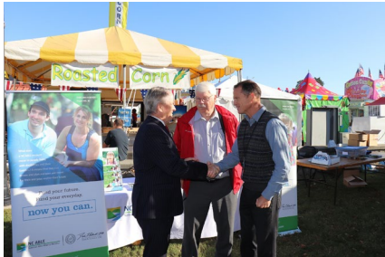
Set up and ready to go at the NC State Fair AccessABILITY Day! It's shaping up to be a beautiful day!