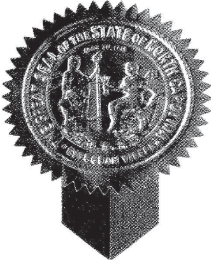
Beverly Eaves Perdue Governor

IN WITNESS WHEREOF , I have hereunto signed my name and affixed the Great Seal of the State of North Carolina at the Capitol in the City of Raleigh, this first day of October in the year of our Lord two thousand and nine, and of the Independence of the United States of America the two hundred and thirty-fourth.